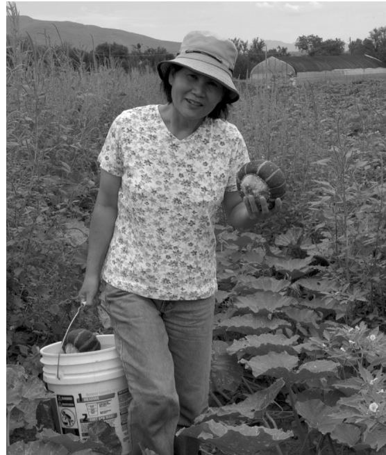
Forever Yong Farm

Over the 40-plus years that CFB has been in existence, it has grown into an anchor institution thanks to the breadth of its work in the region and the partnerships it has developed with community groups, farmers, philanthropy, elected officials, school districts, and other anchor institutions. Tucson has both unique opportunities and challenges because it is situated in a vast, rural border region. For example, there is only one major university and a few hospitals. CFB is starting the work of institutionalizing the anchor mission at their anchor partners' institutions. The Farm-to-Institution program was a good starting point for their anchor collaboration work. Now CFB is looking at how to engage new partners in equitable economic development work.